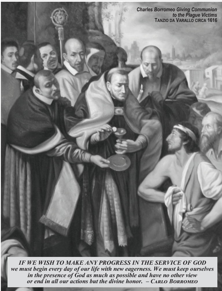
Charles Borromeo Giving Communion to the Plague Victims TANZIO DA VARALLO CIRCA 1616

811 LAWRENCE AVENUE WEST TORONTO ON M6A 1C3 • 416.787.0369 • stcharlesborromeoto.archtoronto.org