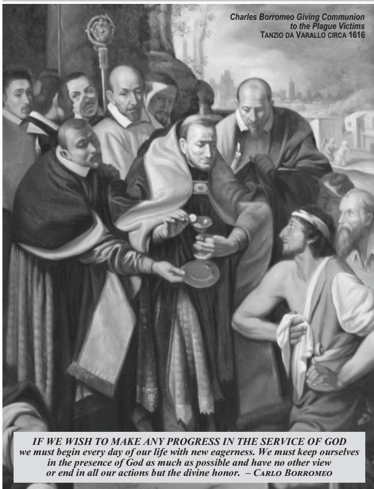
Charles Borromeo Giving Communion to the Plague Victims TANZIO DA VARALLO CIRCA 1616

811 LAWRENCE AVENUE WEST TORONTO ON M6A 1C3 • 416.787.0369 • stcharlesborromeoto.archtoronto.org