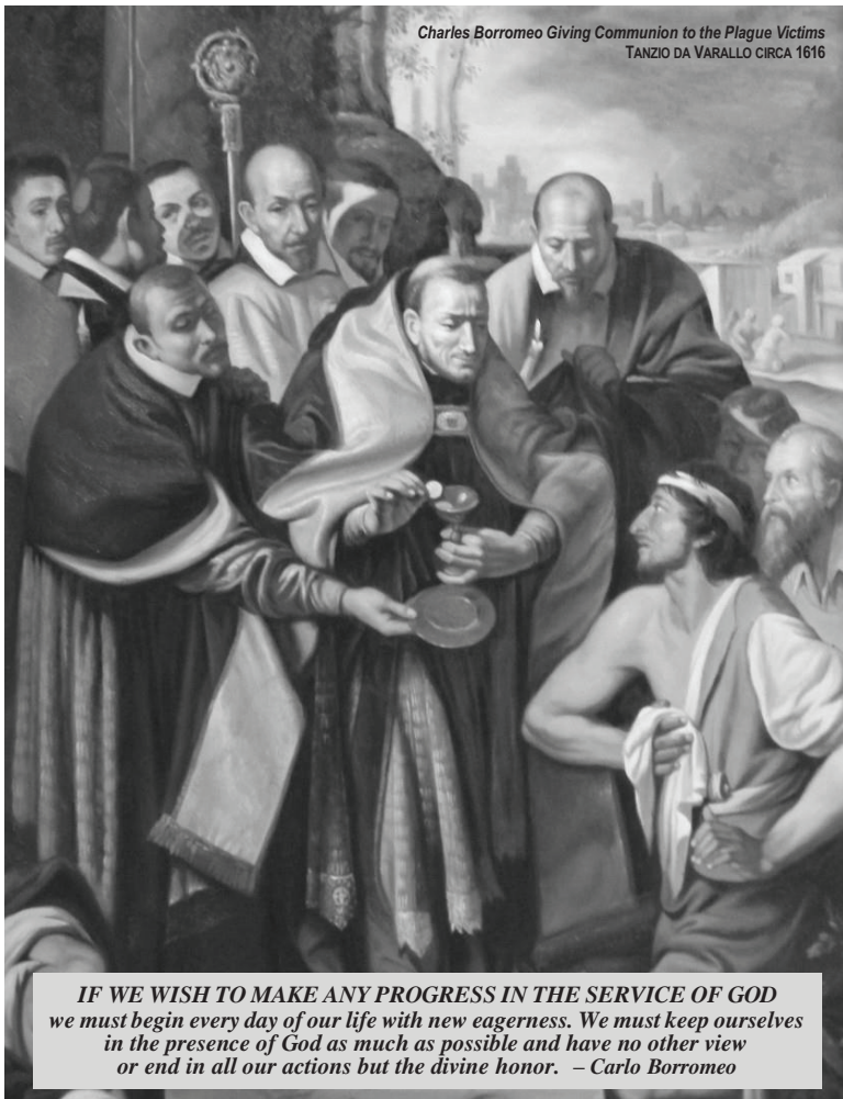
Charles Borromeo Giving Communion to the Plague Victims TANZIO DA VARALLO CIRCA 1616

811 LAWRENCE AVENUE WEST TORONTO ON M6A 1C3 T 416.787.0369 F 416.256.4466 www.stcharlesborromeo.ca