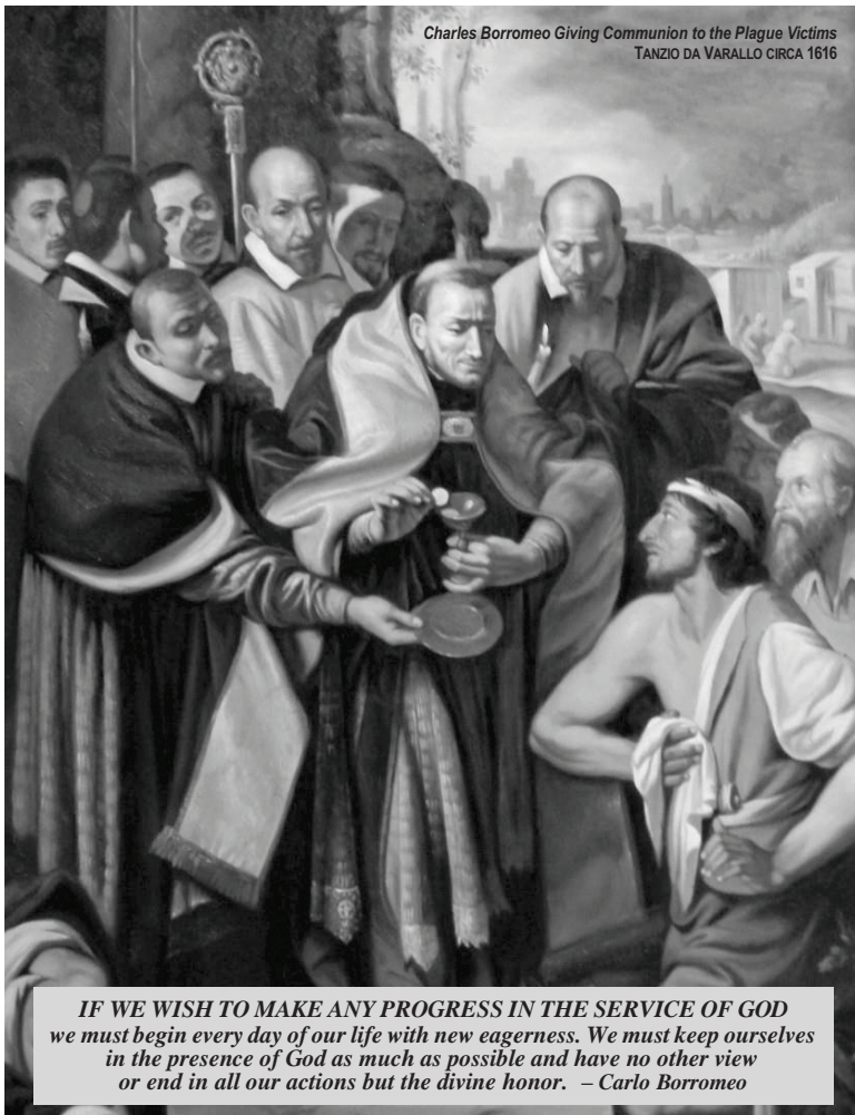
Charles Borromeo Giving Communion to the Plague Victims TANZIO DA VARALLO CIRCA 1616

811 LAWRENCE AVENUE WEST TORONTO ON M6A 1C3 T 416.787.0369 F 416.256.4466 www.stcharlesborromeo.ca