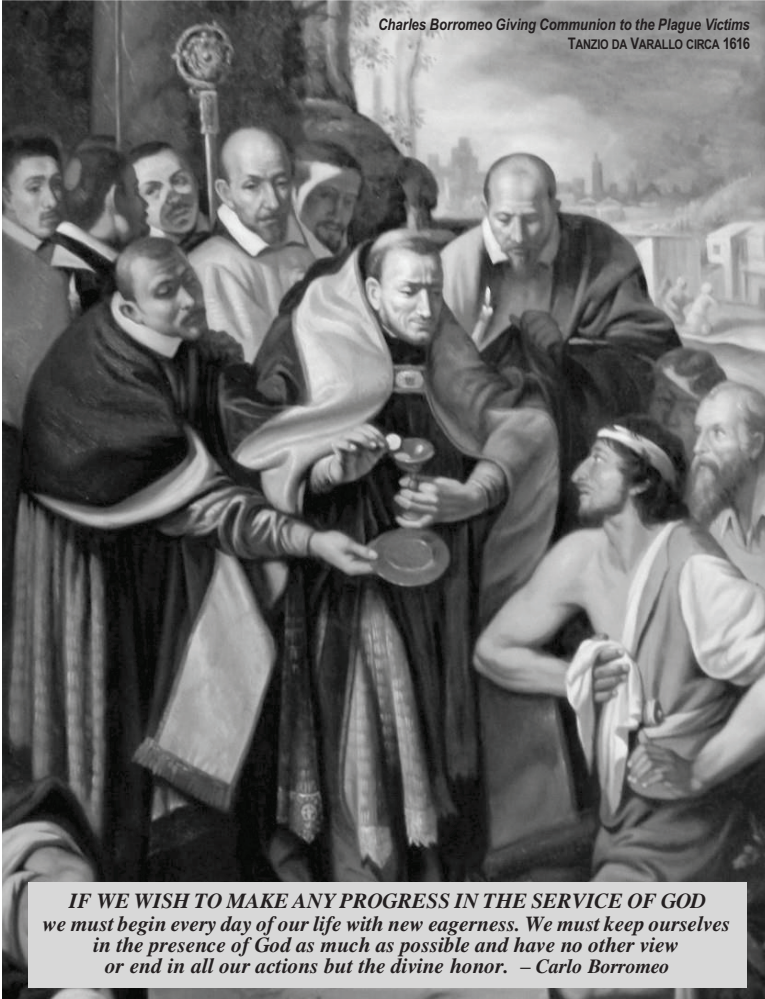
Charles Borromeo Giving Communion to the Plague Victims TANZIO DA VARALLO CIRCA 1616

811 LAWRENCE AVENUE WEST TORONTO ON M6A 1C3 T 416.787.0369 F 416.256.4466 www.stcharlesborromeo.ca