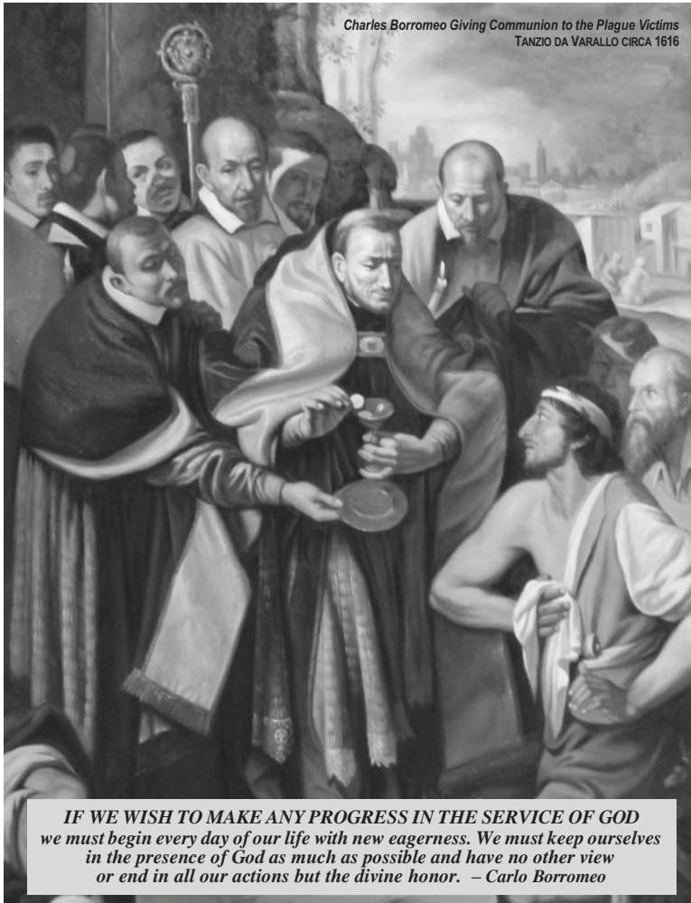
Charles Borromeo Giving Communion to the Plague Victims TANZIO DA VARALLO CIRCA 1616

811 LAWRENCE AVENUE WEST TORONTO ON M6A 1C3 T 416.787.0369 F 416.256.4466 www.stcharlesborromeo.ca