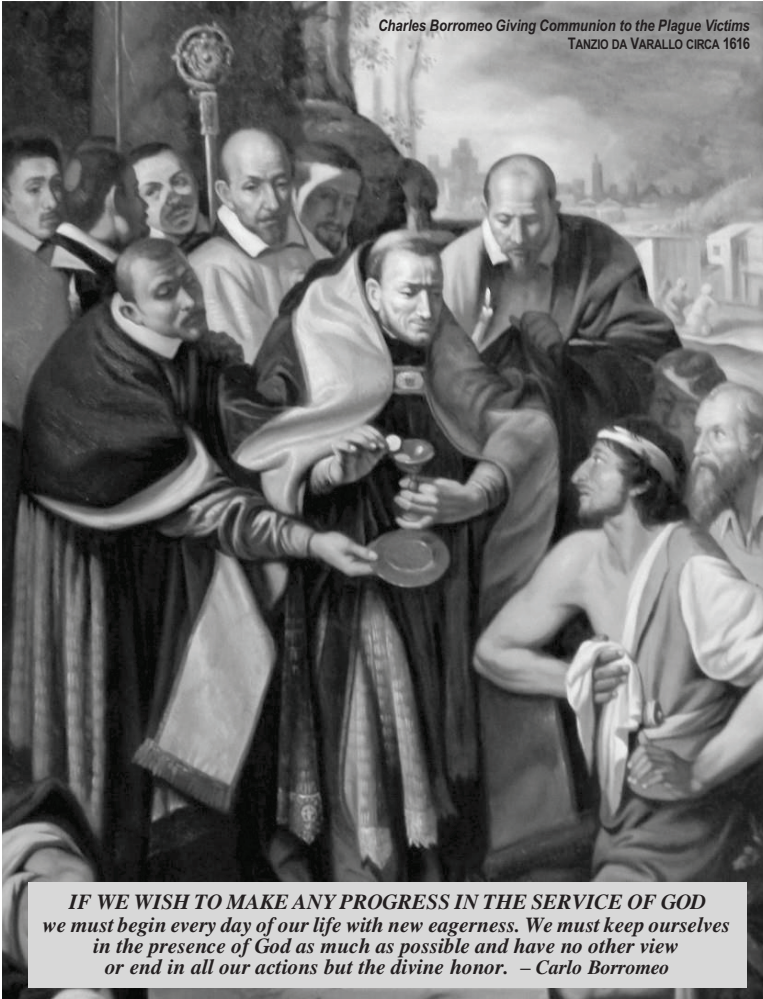
Charles Borromeo Giving Communion to the Plague Victims TANZIO DA VARALLO CIRCA 1616

811 LAWRENCE AVENUE WEST TORONTO ON M6A 1C3 T 416.787.0369 F 416.256.4466 www.stcharlesborromeo.ca