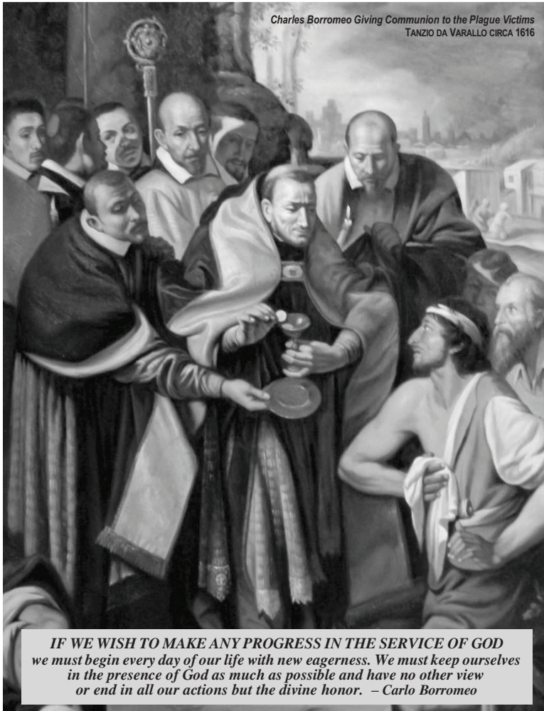
Charles Borromeo Giving Communion to the Plague Victims TANZIO DA VARALLO CIRCA 1616

811 LAWRENCE AVENUE WEST TORONTO ON M6A 1C3 T 416.787.0369 F 416.256.4466 www.stcharlesborromeo.ca